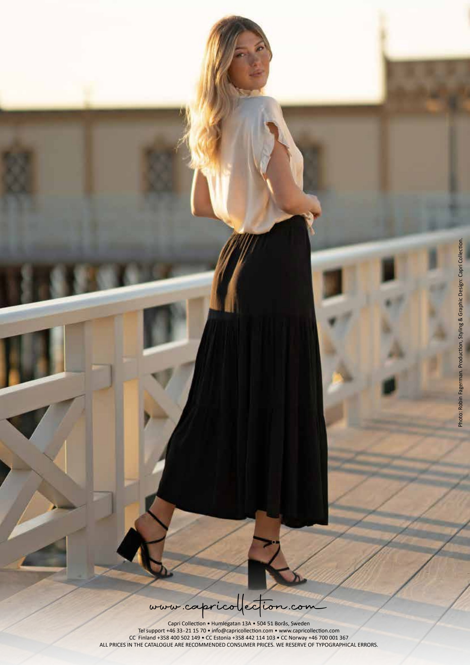
Production, Styling & Graphic Design: Capri Collection.